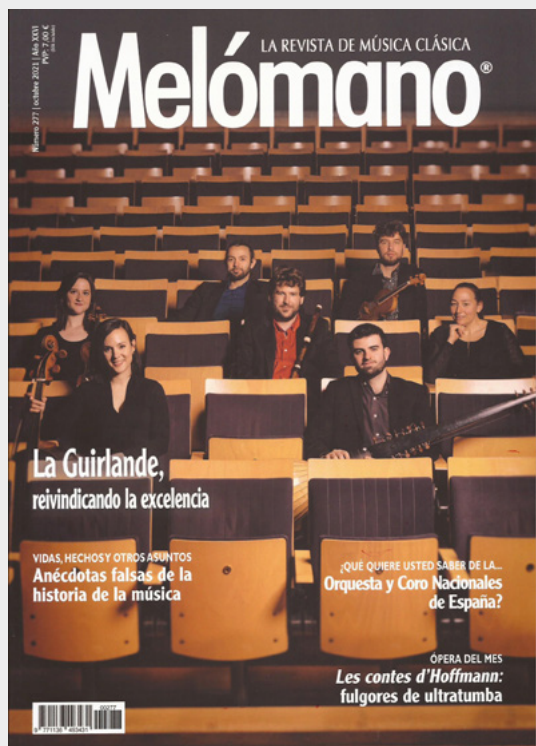
La Guirlande. Cover on Melómano magazine. October 2021